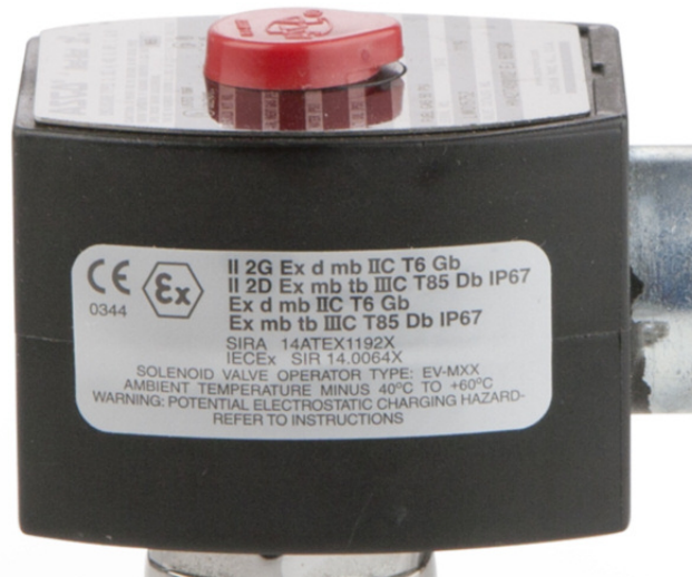
Figure 1: labels may have multiple T-codes to cover every real-world contingency.

If conditions at the facility where the valve will be used might qualify as this kind of special circumstance, consult the valve manufacturer before specifying a final purchase.