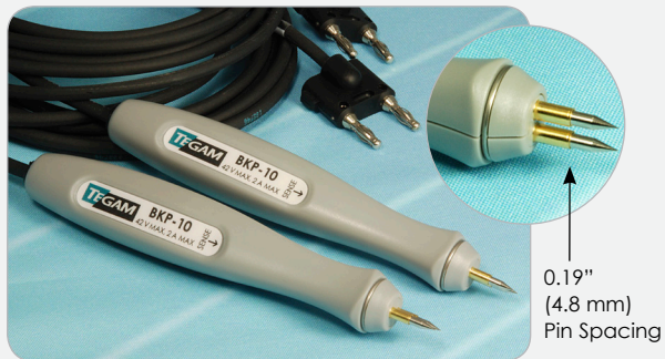
BKP-10 Probe Set with "B" Style Pins Installed