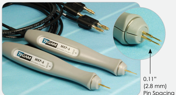
MKP-6 Probe Set with "B" Style Pins Installed