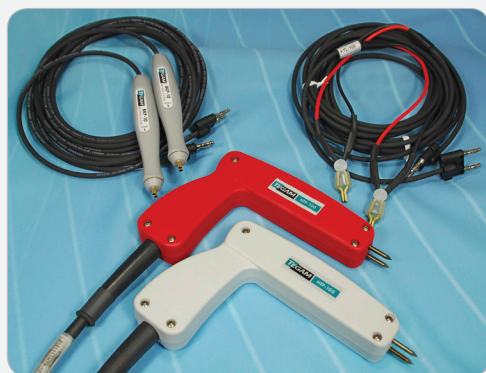
BKP-10 HTP-100 Pistol Grip KTL-100