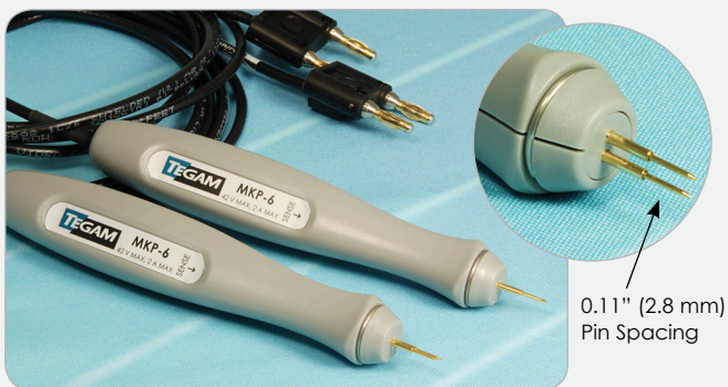
MKP-6 Probe Set with "B" Style Pins Installed