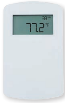
North American Style