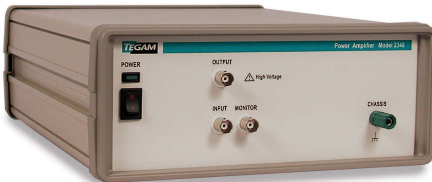
Figure 1: No Load and Full Load Gain (dB) vs. Frequency (Typical)

Amplifier Gain measured at 50 Vp-p Bandwidth 2.0 MHz (-3 dB cutoff).